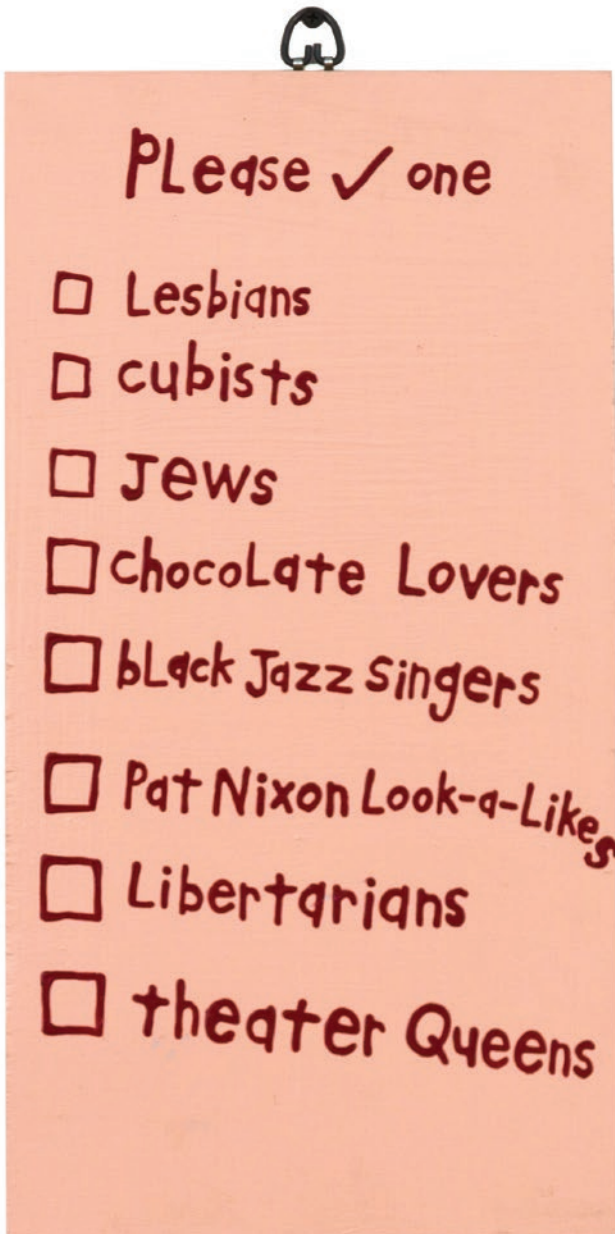
Please Check One... , ca. 1998. Latex paint on wood panel.

The gallery is full with walls of artwork that are hung salon style, installations on the floor of the gallery, and cases full of work. There will be a lot of visual information to take in and while some of the objects will be very familiar to audiences including stuffed animals, candlesticks, knit hats, etc. The work should not be touched.