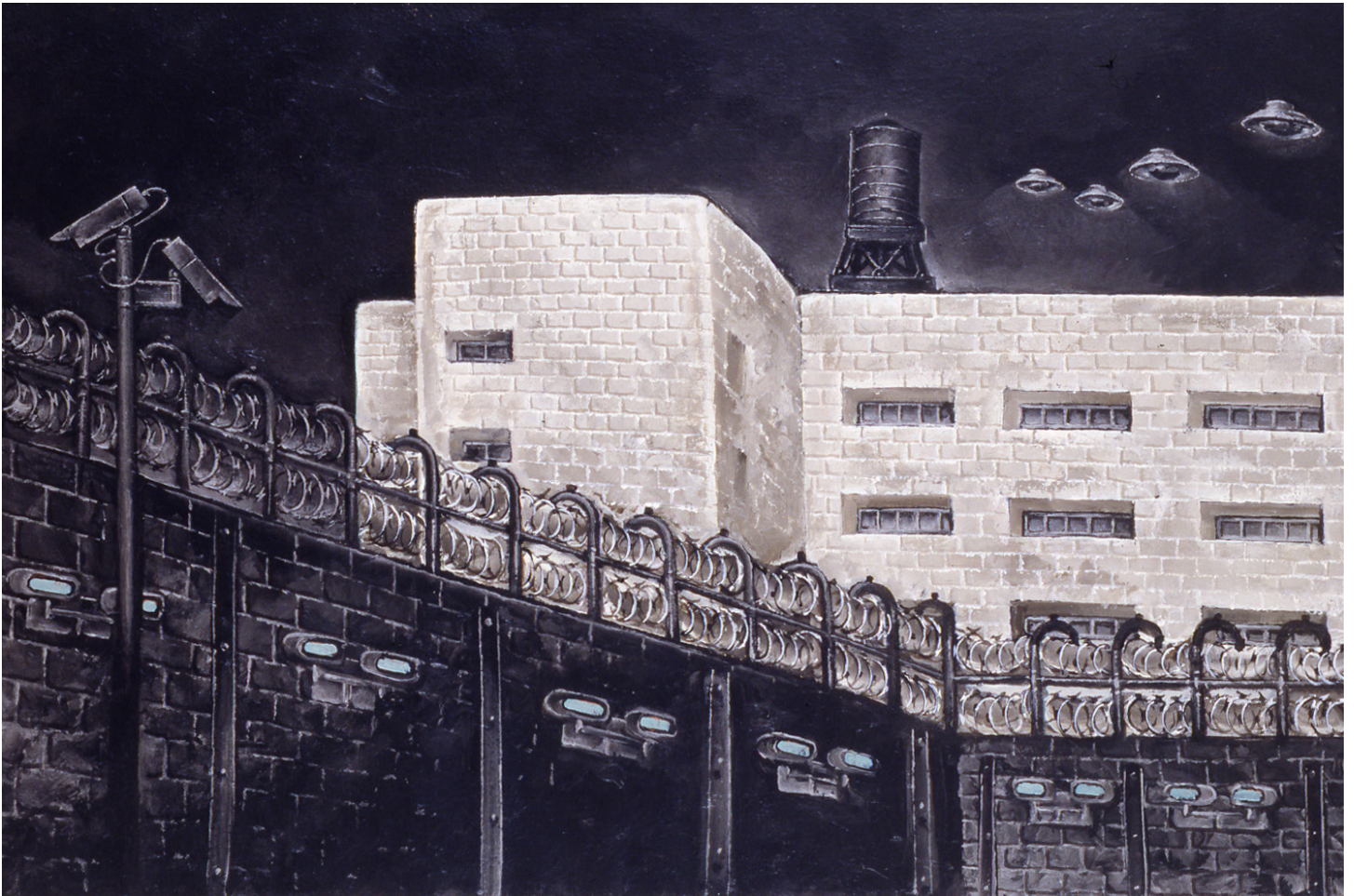
Martin Wong, 47-04 (detail), 1992. Acrylic on canvas, 28 x 70 inches.