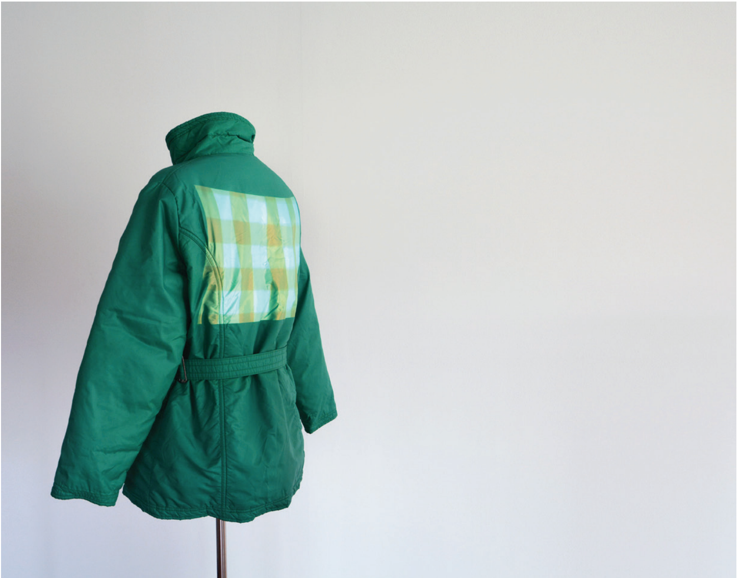
Cheryl Donegan. Blood Sugar , 2013. Dress form with vintage ski jacket; video: color, sound, 5:28 minutes.

CAMH.ORG @camhouston #atCAMH #CherylDonegan