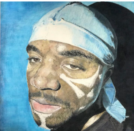
Joyane Eriom Dissolution (detail), 2018 Colored pencil on paper 30 x 24 inches Image and work courtesy the artist