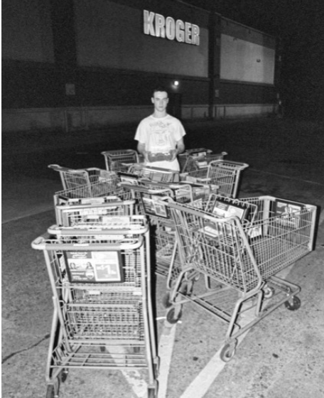
DeCarté May The line is here to protect the art, not to protect you (detail), 2018 Silver gelatin print 36 x 24 inches Image and work courtesy the artist