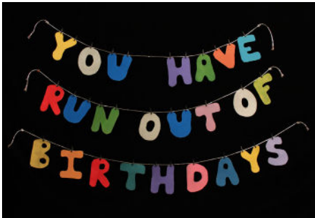
Calista Garcia You Have Run Out of Birthdays , 2018 Acrylic on canvas on string 30 x 45 inches Image and work courtesy the artist

Shapeshifters is the 11th biennial youth art exhibition organized by CAMH's Teen Council. Drawing from an open call, the Teen Council received over 700 submissions responding to the questions: What forms you and/or your generation? How do you define your space? Can you change shapes? The Teen Council chose the theme of shifting shapes knowing that their peers would respond and interpret this idea in a multitude of ways.