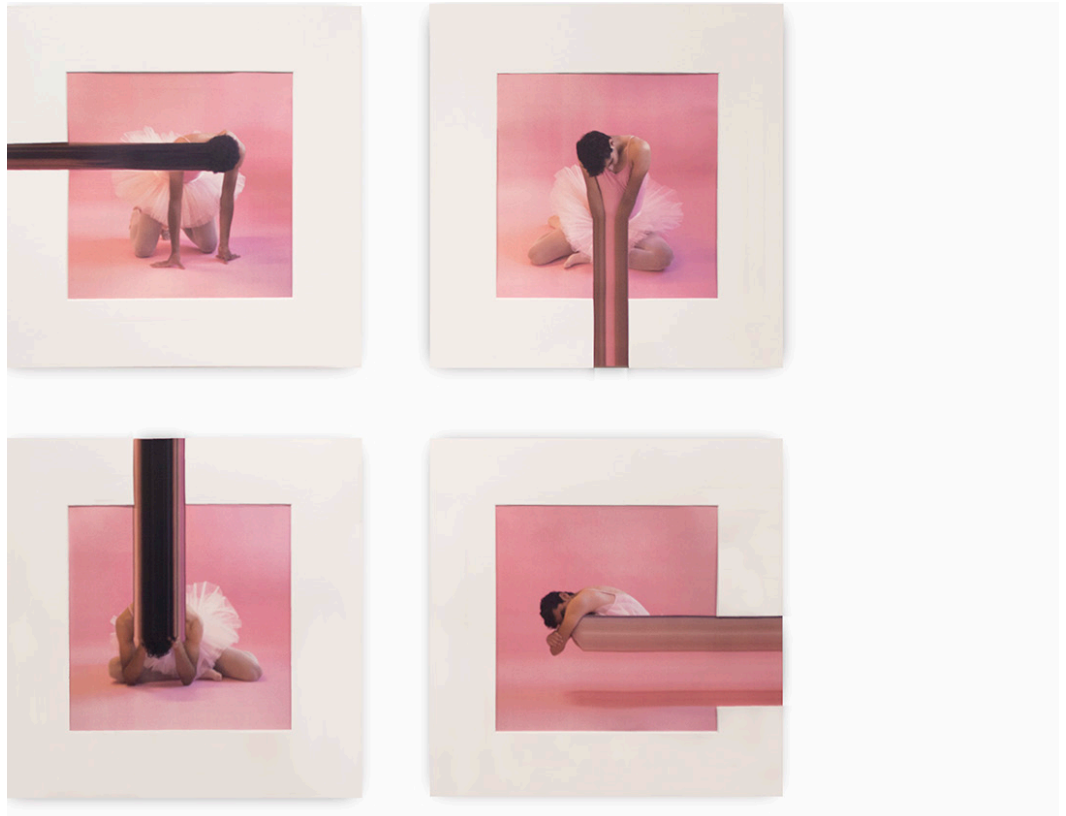
Patrick Hsu, Stretch , 2018. Digital photographic prints (4 parts), 34 x 34 inches (overall). Image and work courtesy the artist.

#ShapeshiftersCAMH #CAMHteencouncil #atCAMH @camhouston