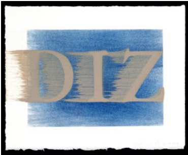
Ed Ruscha DIZ , 2017 Dry pigment and acrylic on paper 5 5/8 x 7 1/2 inches