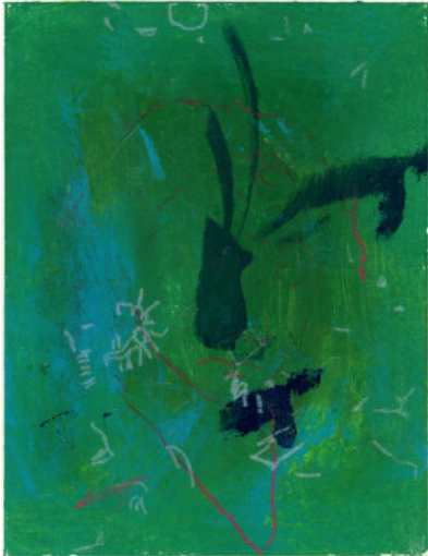
Gael Stack Untitled #1, 2016 Oil on paper 6 x 5 inches Courtesy the artist and Moody Gallery, Houston, Texas