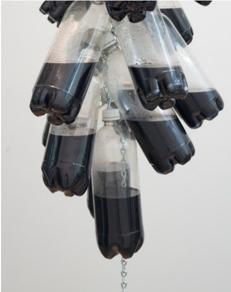
Tony Feher At Least For Now #2 (detail), 2015 Plastic bottles with plastic screw caps, ink, distilled water, stainless-steel wire, and zinc-coated steel chain 162 x 16 x 14 inches Image and work courtesy Sikkema Jenkins & Co., New York, New York

Concert | Musiqa Thursday, May 9, 2019 | 6:30–7:30PM