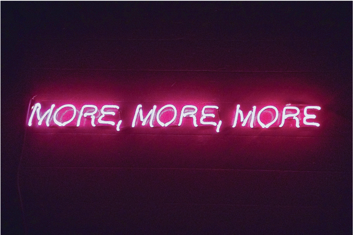
More, More, More , 2013. Glass, neon, electrical components, and hardware. 3 x 28 1/2 x 1 1/2 inches.

CAMH.ORG @camhouston #atCAMH #StevenEvans