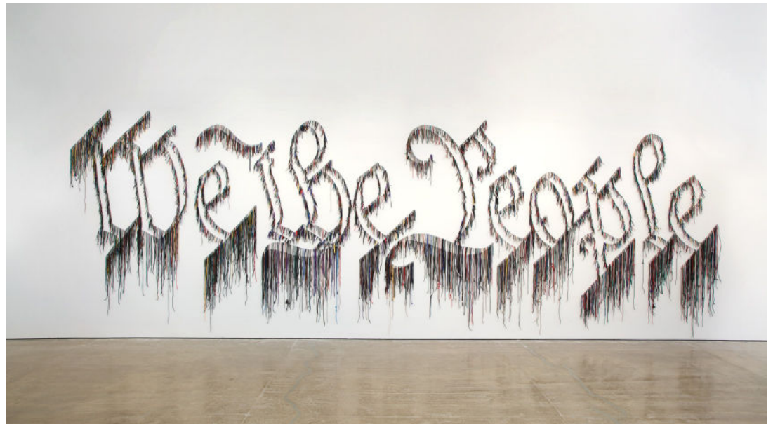
Nari Ward, We the People , 2011. Shoelaces, 96 × 324 inches. In collaboration with the Fabric Workshop and Museum, Philadelphia, Pennsylvania. Collection Speed Art Museum, Louisville, Kentucky; Gift of the Speed Contemporary, 2016.1. © The Speed Art Museum, Louisville, Kentucky.