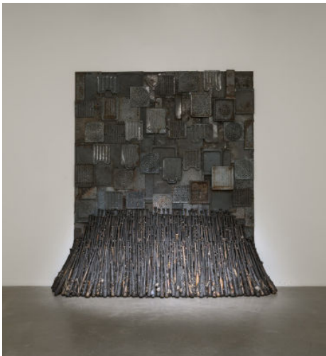
Nari Ward Iron Heavens , 1995 Oven pans, ironed sterilized cotton, and burned wooden bats 140 x 148 x 48 in Collection Jeffrey Deitch

past 25 years. Seeking out the personal and social narratives embedded in materials, he conceives of his sculptures as tools for articulating relationships between people. Over the past three decades, he has addressed topics such as historical memory, political and economic disenfranchisement, racism, and democracy in an effort to express both the tenuousness and the resilience of the artist's Harlem community—a struggle that remains relatable in communities across the United States.