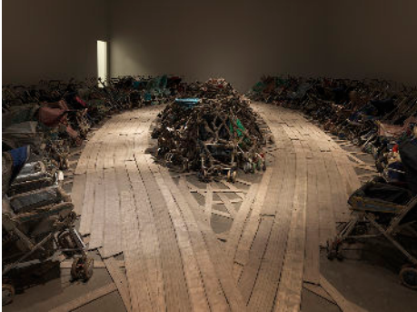
Nari Ward Amazing Grace , 1993 Baby strollers, fire hose, and audio component Dimensions variable Private collection Installation view at New Museum of Contemporary Art, New York, New York, 2019