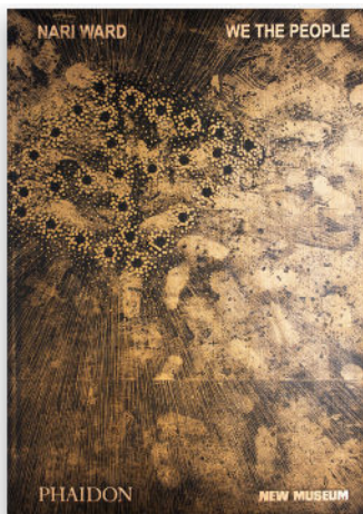
Exhibition catalogue available for purchase in the CAMH Museum Shop.