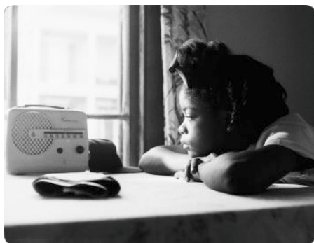
Garrett Bradley America (film still), 2019 Multi-channel video installation; 35mm film transferred to video: black and white, sound, 23:55 minutes Image and work courtesy the artist

individuals she seeks to represent—and results in works that combine both scripted and improvisatory scenes. Bradley’s films explore the space between fact and fiction, embracing modes of working and of representing history that blur the boundaries between traditional notions of narrative and documentary cinema. Her rigorous explorations of the social, economic, and racial politics of everyday life—its joys, pleasures, and pains—are lyrically and intimately rendered on screen. An attention to daily life and its often slow, unremarkable unfolding runs through Bradley’s films, from her earliest works, such as Dante 9-5 (2014), in which we follow a United States Postal Service delivery man along his designated route, to her most recent films, America and AKA (both 2019).