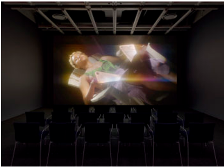
Installation view of the Whitney Biennial 2019 (Whitney Museum of American Art, New York, New York, May 17–September 22, 2019). Garrett Bradley, AKA , 2019.