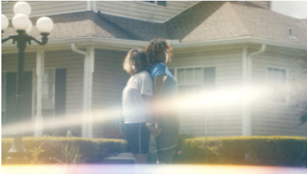
Garrett Bradley AKA (film still), 2019 Video, color, sound, 8:00 minutes Image and work courtesy the artist