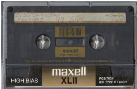
DJ Screw grey tape, courtesy the Special Collections at the University of Houston Libraries.