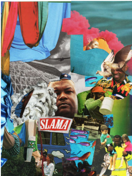
Tay Butler SLAMA , 2020 Digital collage Dimensions variable Courtesy the artist

In their photo-adjacent practices, the participating visual artists appropriate, mash-up, collage, and mutate photographic inputs, in addition to slowing time. Slowed and Thrown contends that remixing “sampled” materials is a radical aesthetic act utilized by both artists and musicians. Through reconfigurations of sourced and original materials, the featured artists draw attention to inequities stemming from race, gender, and sexual orientation, suggesting new possibilities and alternative realities.