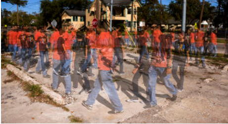
Jimmy Castillo Mendoza's Bakery , 2019 Digital inkjet print 20 x 30 inches

January 21, 2021 and public reopening on January 22. The exhibition will remain on view through Sunday, April 11, 2021. The Museum will employ comprehensive COVID-19 safeguards to ensure the health of our staff and the public.