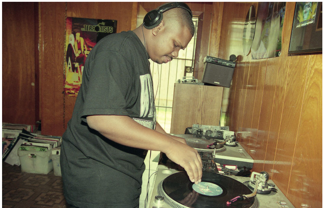
DJ Screw in his home studio.