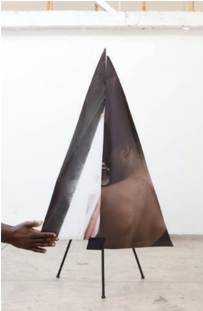
Paul Mpagi Sepuya Mirror Study (OX5A7385) , 2018 Archival pigment print, edition 2/5 13 3/10 x 8 9/10 inches Courtesy the artist and Document, Chicago, Illinois; Team Gallery, New York City, New York; and Vielmetter, Los Angeles, California