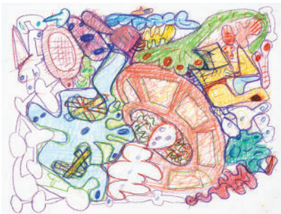
Elizabeth Murray Study for "Kind of Blue" , 2004 Colored pencil on paper 8 1/2 x 11 inches ©2020 The Murray-Holman Family Trust / Artists Rights Society (ARS), New York.