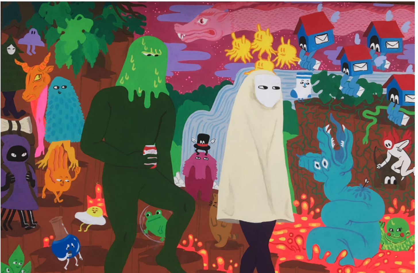
Alec Phipps, A Trip To The Grocery Store , 2020. Gouache on bristol board, 16 x 20 inches. Image and work courtesy the artist.