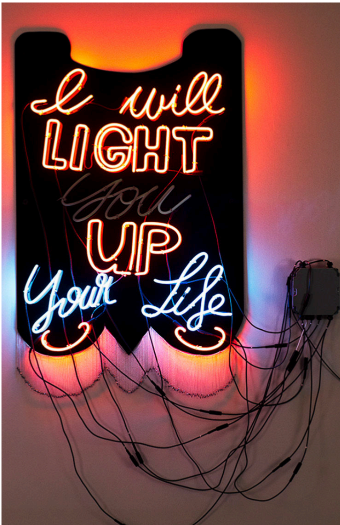
Light Up Your Life (For Sandra Bland) 2019, Neon, Plexiglas, faceted hematite, and aluminum chain 78 x 28 in. (198.1 x 121.9 cm) Blanton Museum of Art; Commissioned and produced by Artpace San Antonio. Purchase through the generosity of an anonymous donor, 2020