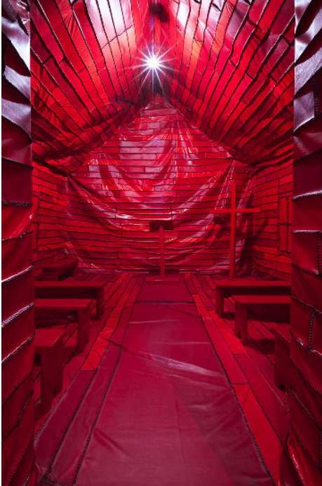
Rodney McMillian Asterisks in Dockery (Blues for Smoke) , 2012 Vinyl, thread, wood, paint and lightbulb 180 x 186 x 216 inches Courtesy of the artist and Vielmetter Los Angeles Photo by Brian Forrest

the featured works illuminate the historical roots and expansive narratives that frame Black experiences. Yet, common themes emerge from these disparate sonic and visual expressions that speak collectively of the forces that have shaped and sustained Black communities and cultures throughout the decades: the refuge of landscape—natural and man-made; an enduring system of spiritual beliefs and philosophies foundational to both sacred and secular thought; and the Black body itself. The exhibition's massive Cabinet of Wonder contains musicians' stage wear, instruments, and ephemera, including Bo Diddley's guitar, outfits worn by James Brown and CeeLo Green, Ornette Coleman's saxophone, and original DJ Screw "grey tapes."