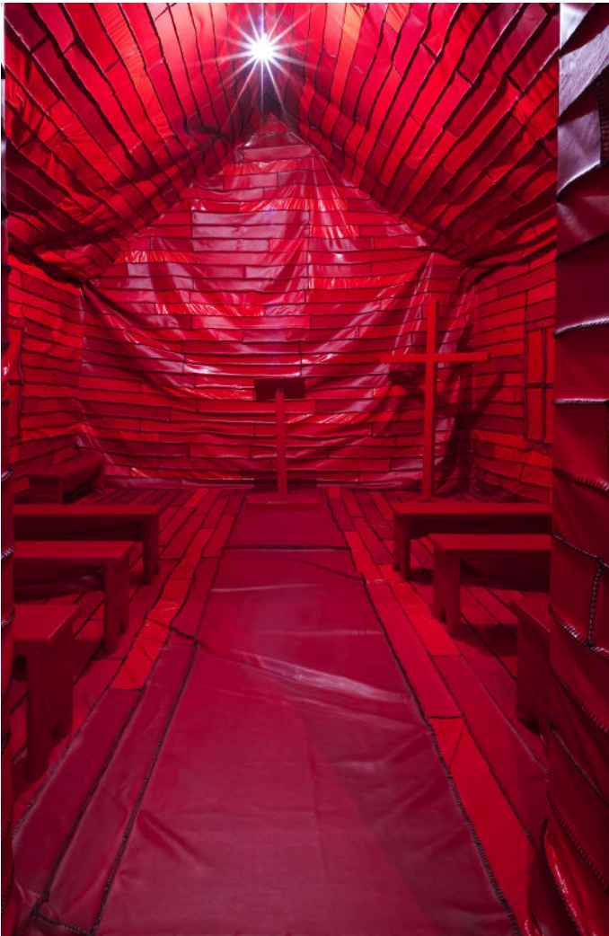
Rodney McMillian (American, born 1969), From Asterisks in Dockery , 2012. Vinyl, thread, wood, paint, light bulb.