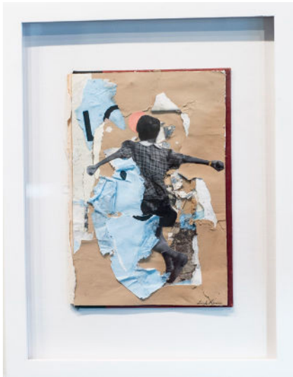
Lanecia Rouse, won't you celebrate with me (Title inspired by a Lucille Clifton poem of the same name), 2021, 12 x 9 inches, Mixed media collage on discarded book cover, courtesy of artist.