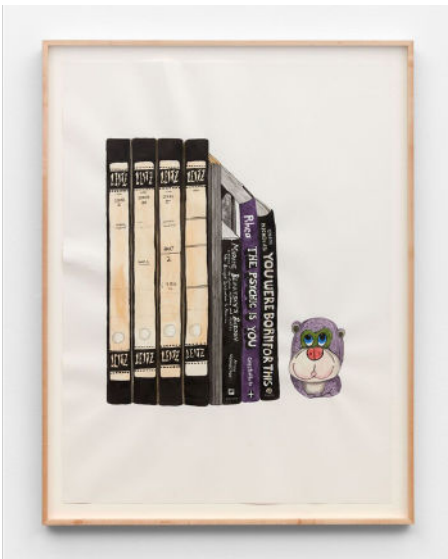
Mariah Garnett, The Psychic is You , 2021, 32 3/4 x 25 1/2 inches, Watercolor on Arches paper, natural maple frame, courtesy of artist and Commonwealth & Council, Los Angeles.

This year's After Party welcomes guests into an exclusive nightclub atmosphere from 10PM–midnight in the Museum's lower-level Nina and Michael Zilkha Gallery. The night will feature music from Wassu, flying from Berlin for this one-night event. Guests can also enjoy a VIP lounge curated by BeDESIGN and CIEL Restaurant + Lounge. After Party tickets are $250 per individual.