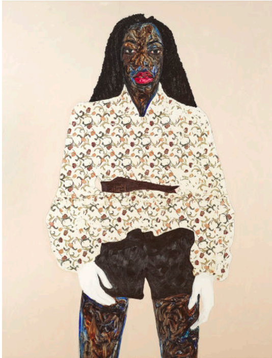
Amoako Boafo, Umbur Brown Belt , 2020. Paper transfer and oil on canvas, 82 5/8 x 66 7/8 inches. Courtesy the Collection of Marilyn & Larry Fields.