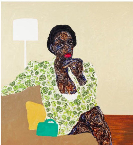
Amoako Boafo, Green Clutch , 2021. Paper transfer and oil on canvas, 82 5/8 x 70 7/8 inches. Courtesy Private Collection and Mariane Ibrahim Gallery, Chicago and Paris.

The exhibition's title is inspired by the seminal ethnographic study of Black life behind the veil of race by sociologist and Pan-Africanist W.E.B. Du Bois, The Souls of Black Folk . Du Bois, who is buried near Osu—a neighborhood in Accra, Ghana near where Boafo grew up—conducted research that resulted in the coining of the phrase “double-consciousness,” which evokes the sense of Black people constantly having to look at themselves through the eyes of others. Du Bois's text serves as an invitation to think deeply about Boafo's artistic practice and how it challenges an “othered” gaze concerning the Black figure.