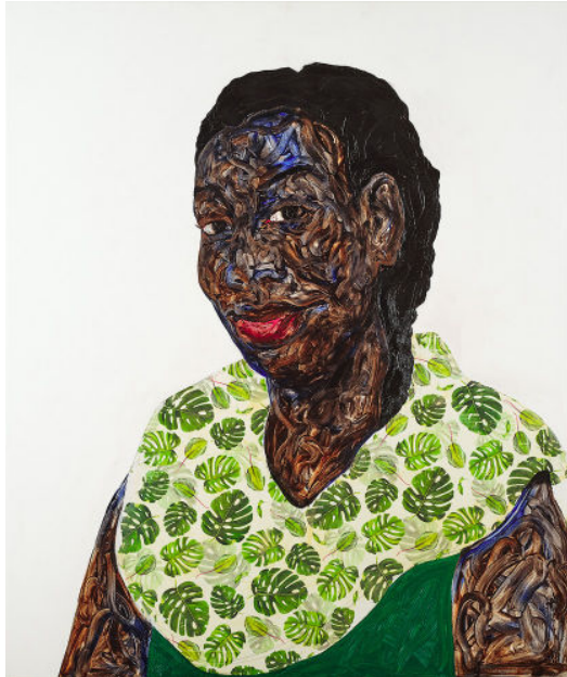
Amoako Bofo, Monstera Leaf Cape , 2021. Paper transfer and oil on canvas, 47.2 x 39.4 inches.