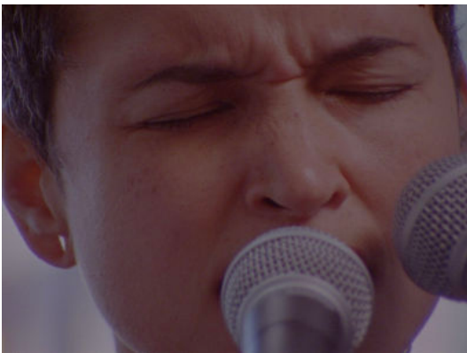
Mariah Garnett, Dreamed This Gateway , 2022 (video stills). 5-channel video installation, 16mm film transferred to 4K video: color, sound, 25:13 minutes. Commissioned by Contemporary Arts Museum Houston.