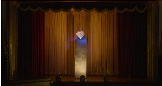
Mariah Garnett, installation view of A Heart of Opal Fire at Commonwealth and Council, Los Angeles, 2021. Courtesy the artist and Commonwealth and Council, Los Angeles. Photo by Ruben Diaz.