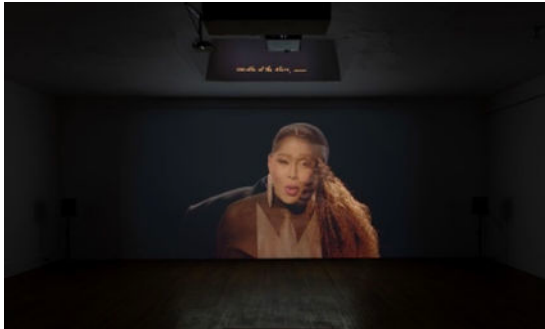
Installation view of A Heart of Opal Fire at Commonwealth and Council, Los Angeles, 2021.