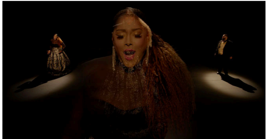
Mariah Garnett, The Pow'r of Life is Love (video still), 2021. Multi-channel video installation, 4K video: color, sound, 13:00 minutes.

HOUSTON, TX (April 26, 2022)—Contemporary Arts Museum Houston (CAMH) is pleased to announce the upcoming exhibition, Mariah Garnett: Dreamed This Gateway , the first U.S. solo museum presentation of the work of Los Angeles-based artist and filmmaker Mariah Garnett (b. 1980, Portland, Maine). On view in CAMH's Nina and Michael Zilkha Gallery from June 10–August 28, 2022, the exhibition features new and recent operatic videos, including a multi-channel installation commissioned by CAMH.