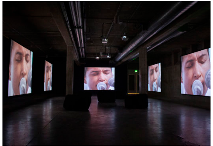
Mariah Garnett with Holland Andrews, Dreamed This Gateway , 2022 5-channel video installation, 16mm film transferred to 4K video: color, sound, 25:13 minutes, Commissioned by Contemporary Arts Museum Houston (CAMH), courtesy the artist and Commonwealth and Council, Los Angeles