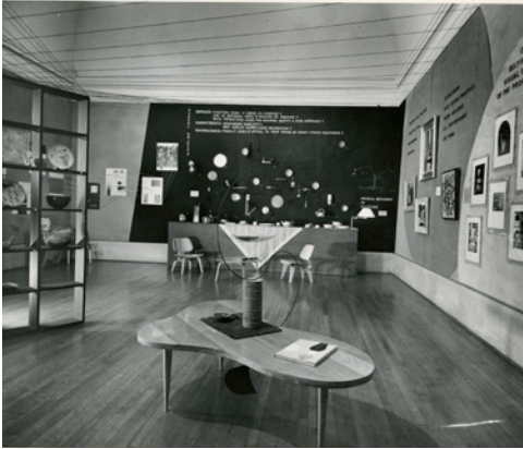
Installation view of This Is Contemporary Art organized by Contemporary Arts Museum Houston (then Contemporary Arts Association) at the Museum of Fine Arts Houston, 1948.