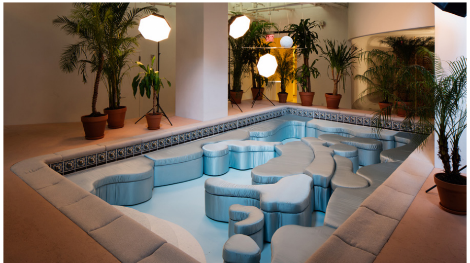
Mel Chin, Convo Pool, 2016/2023. Wood, upholstery fabric, hardware, vinyl, lights, and plants. Installation view of TOTAL PROOF: The GALA Committee 1995-1997 at Red Bull Arts New York, 2016. Image and work courtesy the artist.