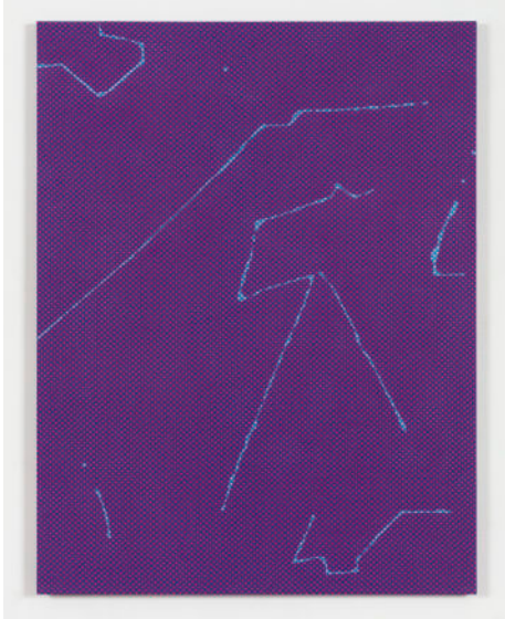
Cheryl Donegan Untitled (dots_purple_blue) , 2015 Hand-dyed cotton fabric 50 x 36 inches Image and work courtesy the artist