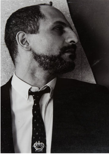
Nicolas Moufarrege.

for help!" In Moufarrege's juxtaposition of the two images, the wave appears perpetually ready to swamp the already drowning woman. The Truth About John the Baptist (1983) is a pastiche of embroidered images: the comic book characters Silver Surfer and The Thing bookend a depiction of Moses in the bulrushes; floating atop the scene, the statement "My father taught me Arabic calligraphy" is rendered in calligraphic flourishes. Eschewing binaries like East and West, fictional and real, and by establishing temporal connections between history and the present, Moufarrege posits new ways to connect with and approach narrative storytelling. He does so as a knowing provocateur, with a wink and a smile, offering us new ways to address images, situations, and layered identity.