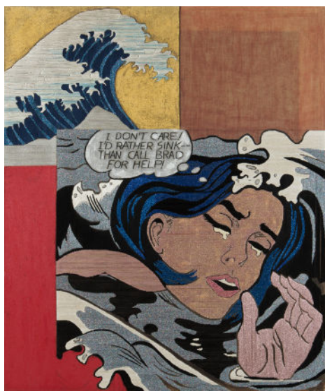
Nicolas Moufarrege Title unknown, 1984 Thread and pigment on needlepoint canvas 39 1/4 x 31 7/8 inches Image and work courtesy Nabil Moufarrej and Gulnar "Nouna" Mufarrij, Shreveport, Louisiana

is organized by CAMH Curator Dean Daderko. The Museum will host a public opening reception on the evening of Friday, November 9, 2018 from 6:30–9 PM. The exhibition will be on view through February 17, 2019. As always, admission to CAMH is free.