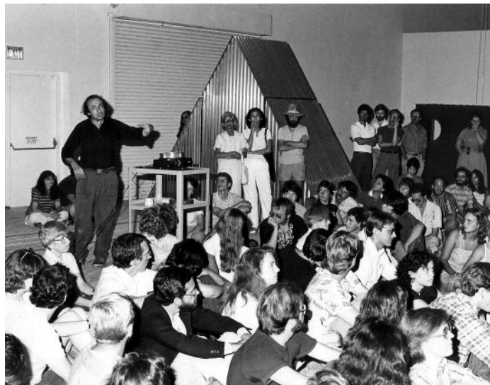
Vito Acconci gallery talk at the Contemporary Arts Museum Houston on August 8, 1981

HOUSTON, TX (September 18, 2017)—The Contemporary Arts Museum Houston (CAMH) is excited to announce the donation of its extensive archive to the Woodson Research Center, a division of the Fondren Library at Rice University. The archive documents the history of CAMH since its founding in 1948. Exhibitions, interviews, and lectures with once emerging artists and now luminaries of contemporary art history will be of great interest and accessible to scholars, lovers of art, and future art historians. The relationship between CAMH and Rice University will be ongoing, as the museum continues to add to the repository of materials in the coming years. This will allow CAMH’s archival collection to be available and searchable for all interested in the art history that has occurred in Houston.