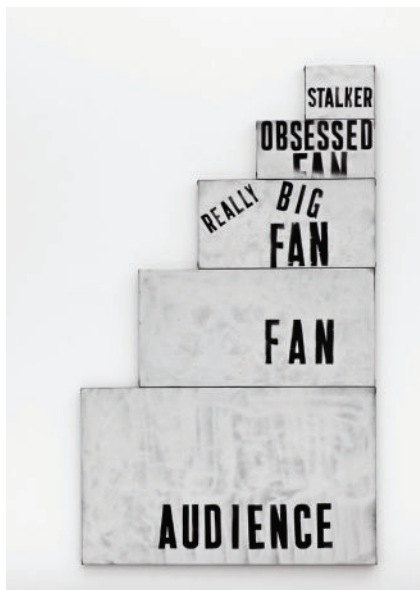
Mark Flood Silver Ziggurat 1 , 2009 Mixed media, acrylic, and spray paint on canvas 101 × 60 inches (5 parts) © Mark Flood

The Contemporary Arts Museum Houston is located at 5216 Montrose Boulevard, at the corner of Montrose and Bissonnet, in the heart of Houston's Museum District. Hours are Tuesday, Wednesday, and Friday 10AM–7PM, Thursday 10AM–9PM, Saturday 10AM–6PM, and Sunday 12PM–6PM. Admission is always free. For more information, visit www.camh.org or call 713 284 8250.