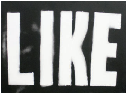
Mark Flood 5000 LIKES (detail), 2015–16 Spray paint on canvas (5,000 parts) Each 12 x 16 inches

create bureaucracies between art and the public; instead he favors the crazy democracy of passionate collectors and prickly critics, of the insulting interaction between Internet users termed flaming, and of socially irresponsible art makers. Known for his prankster antics and mocking commentary, Flood continues to challenge what he considers to be the questionable values held dear by our society in general and the contemporary art world in particular, making his ethically coherent work irreverent, ironic, and self-deprecating.