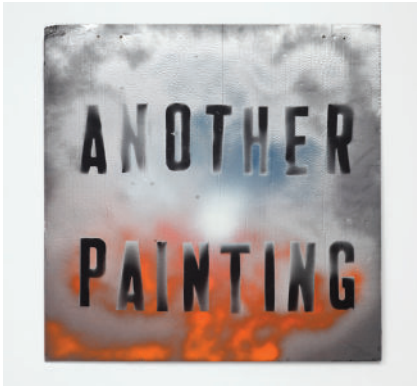
Mark Flood ANOTHER PAINTING (Orange) , 2008 Mixed media, acrylic, and spray paint on cardboard 44 x 44 inches © Mark Flood Image courtesy Peres Projects, Berlin

The lace paintings in particular are meant to seduce the viewer through a self-consciously superficial beauty that is as easy as it is enticing. Their vivid colors, rich surfaces, and delicate patterns are beautiful even though the “trick” of their manufacture—lace applied, painted over, and removed—is made totally obvious. The fact that these paintings are offered as irresistible to passionate art collectors frees him from much of the soul-degrading job of art making, instead allowing his studio to function as a joyful school for art world sedition.