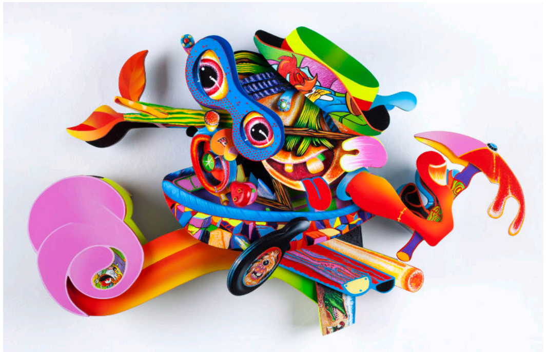
John Hernandez, Pinocoboot , 2015. Acrylic on wood and hardware, 32 x 23 x 7 inches. Image and work courtesy the artist.