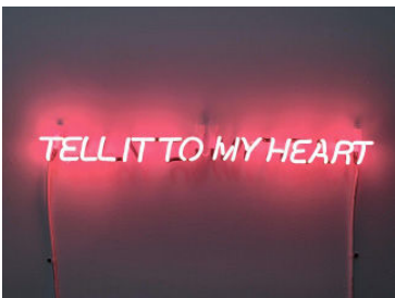
Tell It To My Heart, 2018