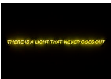
There is a Light That Never Goes Out, 2013-18