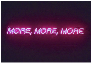
More, More, More, 2013