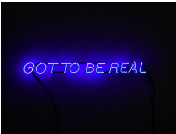
Got To Be Real, 2017