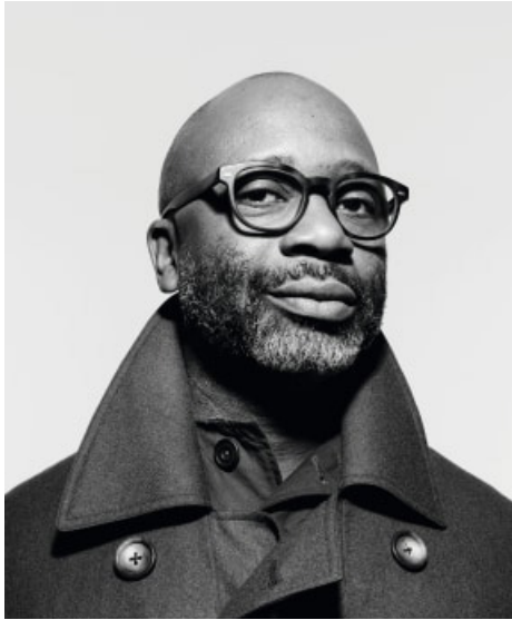
Headshot of Theaster Gates.