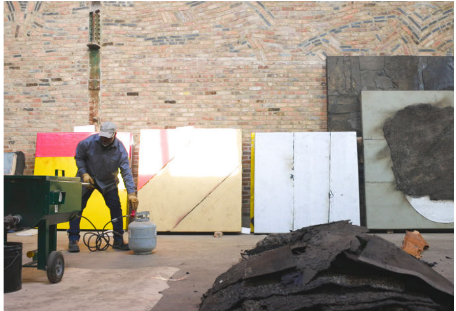
Theaster Gates tarring in his Chicago studio. 2023.

HOUSTON, TX (March 21, 2024) - Contemporary Arts Museum Houston (CAMH) is excited to announce the upcoming exhibition, Theaster Gates: The Gift and The Renegade , featuring a series of large-scale paintings, sculptures, and installations that reckon with histories of labor, material legacies, and the sociopolitical architecture of the built environment. Born out of a multi-layered engagement with historic bricks from Houston's Freedman's Town, The Gift and The Renegade contends with patterns of promise and retraction related to the fight for land, particularly for racialized and subjugated communities.