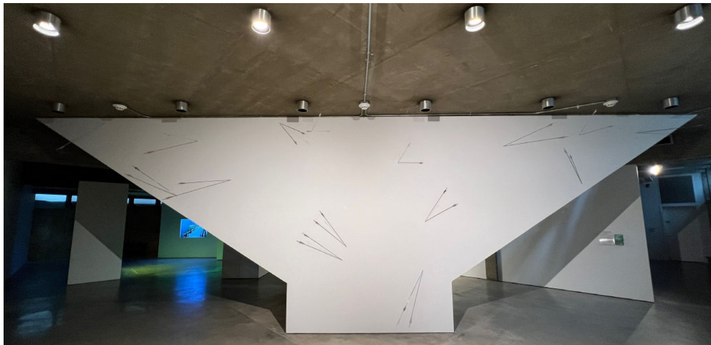
Olivia Erlanger, Eros (when night was last dark) , 2024. Polished aluminum.