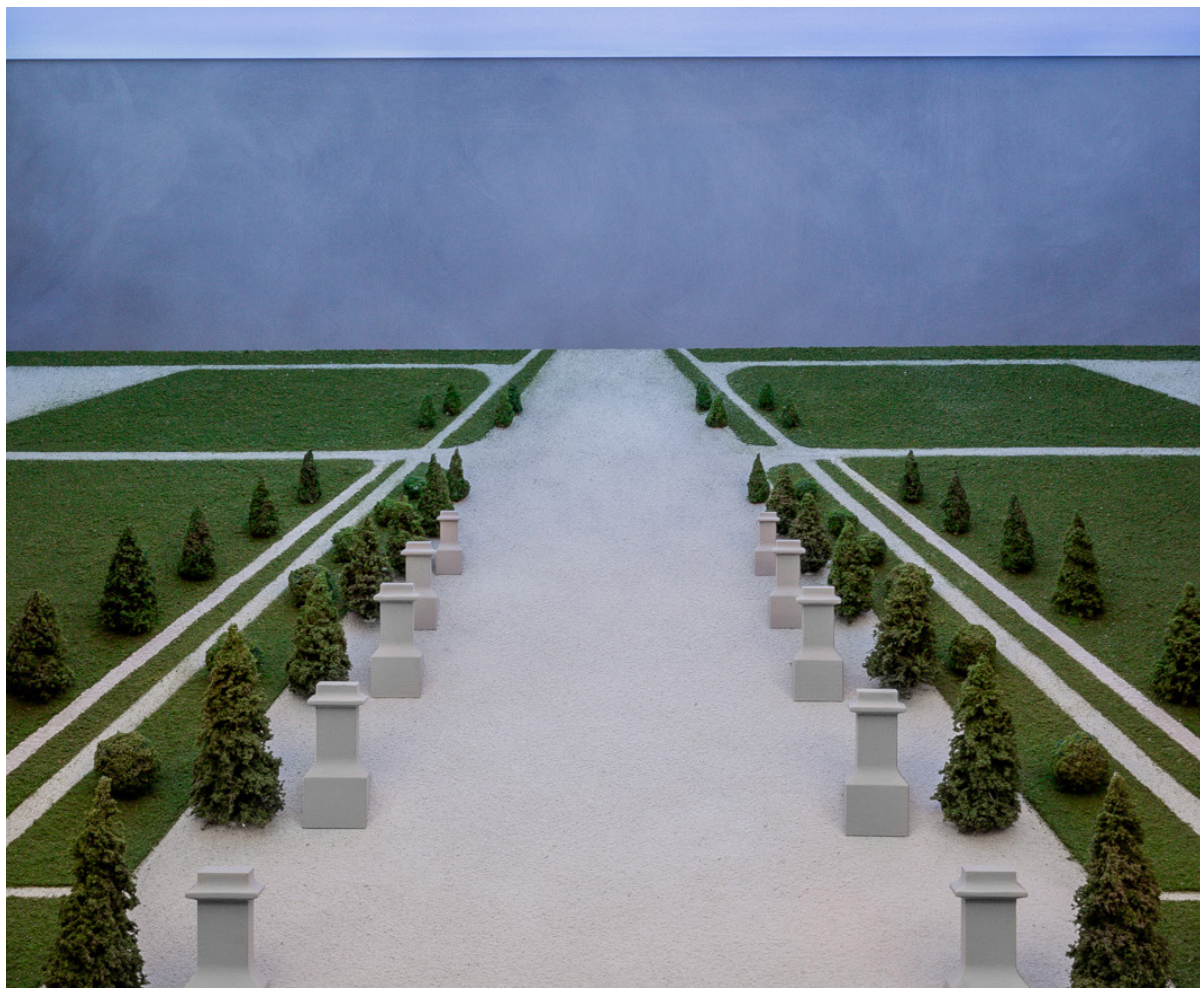
Olivia Erlanger, Blue Sky , 2024. Wire, flocking, foam, plaster, acrylic, aluminum, graphite, shoe polish, LED, and driver

This content review is designed to communicate accessibility and powerful subject matters within this exhibition.