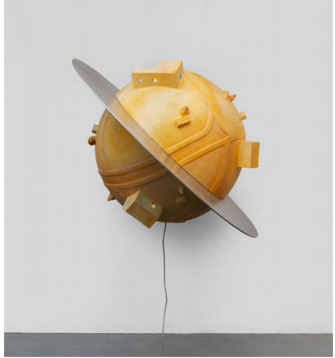
Olivia Erlanger, Antimeridian , 2024, Aquaresin, aluminum, LEDs, drivers, cord, 59 1/2 x 74 1/2 x 36 inches. Artwork courtesy the artist and Soft Opening, London. Image courtesy Daniel Terna.