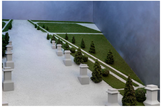
Olivia Erlanger, Blue Sky , 2024. Wire, flocking, foam, plaster, acrylic, aluminum, graphite, shoe polish, LED, and driver