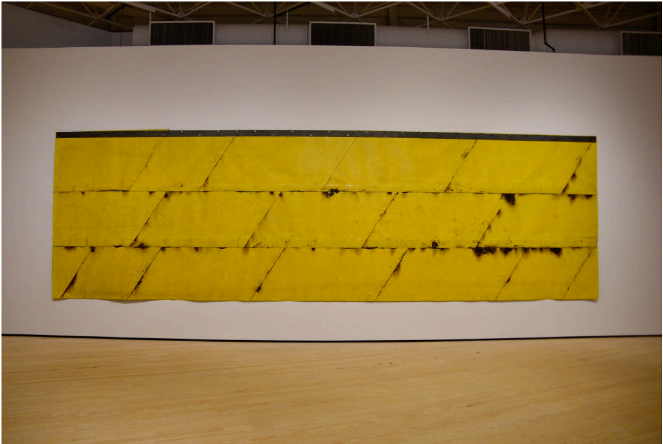
Theaster Gates, Bright Sunny Day , 2024 Torch down, bitumen, enamel- based industrial paint, and steel. Artwork courtesy Theaster Gates. Image courtesy of Phillip Pyle, II