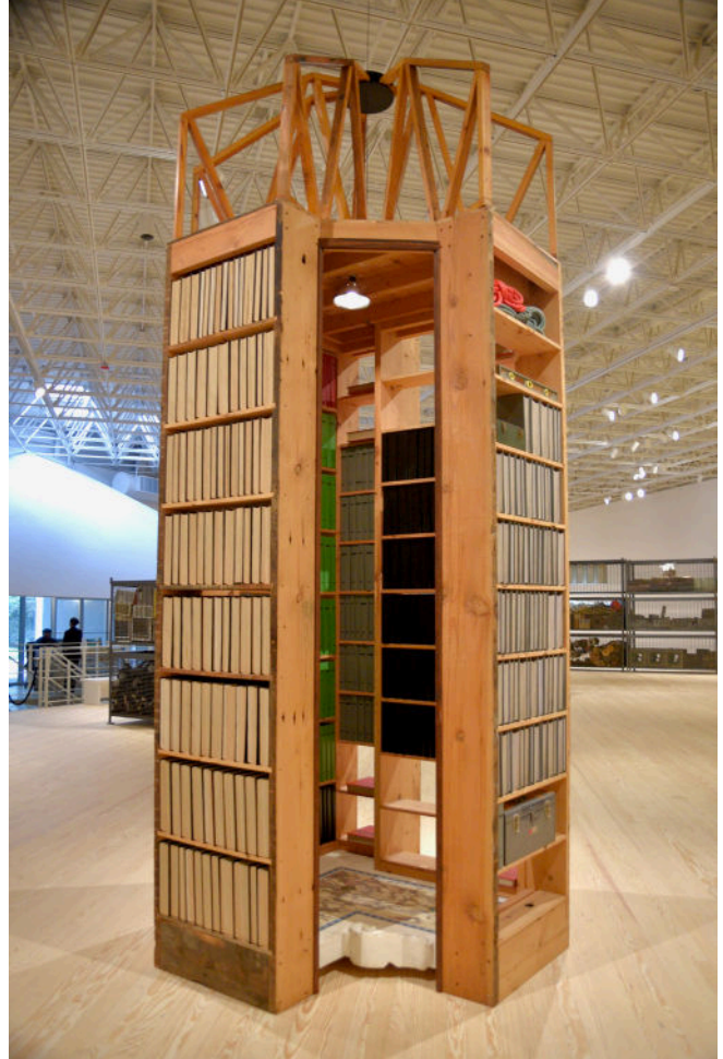
Theaster Gates, New Egypt Sanctuary of the Holy Word and Image , 2017 Wood, marble, bound periodicals, found objects, and light. Artwork courtesy Theaster Gates.