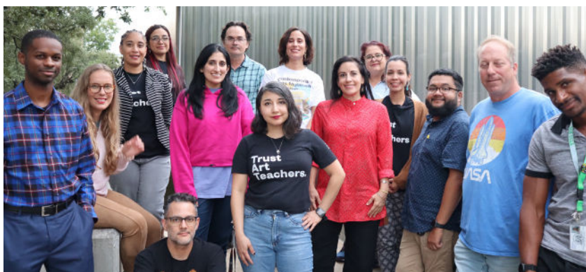
2023-24 Teacher Advisory Group

Mid Main Lofts 3550 Main Street, Houston, Texas 77002 @camhouston @camhshop CAMH.ORG CAMH.SHOP #TrustArtists #TrustArtTeachers