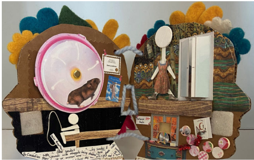
Emery Goldstein, HSPVA, 2024, Brain Busy Board , Cardboard, felt, yarn, paper, wood, wire, brads, and Velcro. Image and work courtesy of the artist.