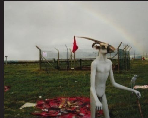
Jane Alexander, Harbinger with rainbow , 2004

Context , or the environment that surrounds a work of art, is important to Alexander's work. She takes photographs of the same figures in several places and with different clothes and objects in order to change the way people see them.