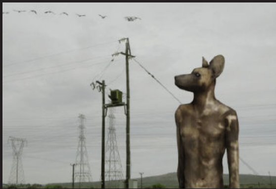
Jane Alexander, Corporal , 2008

Jane Alexander creates sculptures of hybrids – figures that combine the features of two different things (such as humans and animals). For example, in Corporal (2008), Alexander combines the body of a man with the face of a dog.