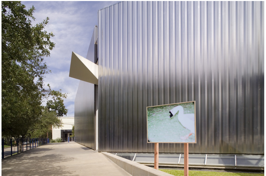
Render image of Bucky Miller installation at the Contemporary Arts Museum Houston, Texas, 2018.