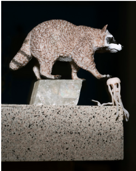
Bucky Miller Second Raccoon , 2017 Pigment print on vinyl on sign 25 x 20 inches