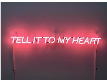
Tell It To My Heart, 2018