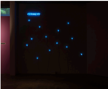
It's Raining Men, 1993–2019