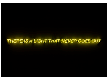
There is a Light That Never Goes Out, 2013-18